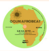
Fresh Me Up 2018 Single