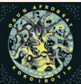
Koko Iroyin 2016 Álbum