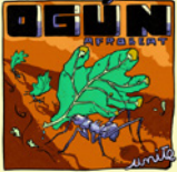
Unite 2021 Álbum