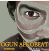
The Observer 2016 Álbum

This stylistic elasticity has endowed the Madrid-based Afro band with the capacity to transcend geographical and musical borders, filling up their calendar with a variety of popular festival performances, performing all around Spain.